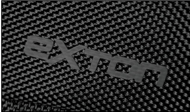
PRINTED TONE-ON-TONE BRANDING